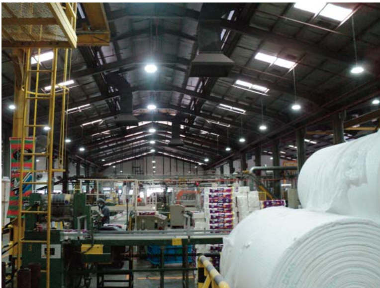
Dialight's DuroSite® LED High Bay fixtures installed in one of Kimberly-Clark's paper mills

Aiming to reduce energy consumption and improve visibility within the plant, the company recently replaced 114 of its 400W metal halide lighting fixtures with Dialight's DuroSite LED High Bays. Consuming just 123W, the Dialight High Bays have enabled the company to slash energy consumption and dramatically improve visibility, all while making the work environment more comfortable and safer for employees. The company has been so impressed with the results, it's now considering an upgrade to Dialight fixtures at other areas within the mill premise.